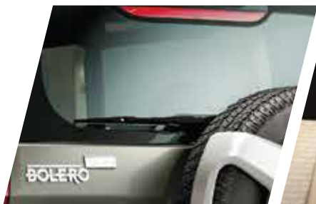
Rear wash and wiper with defogger