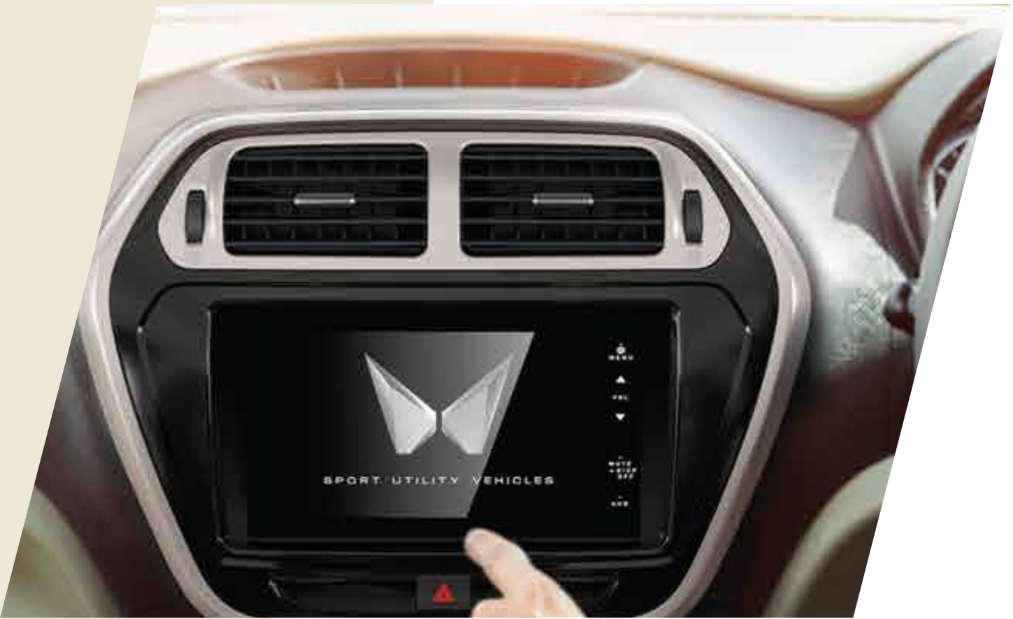
Advanced 22.8 cm touchscreen infotainment system