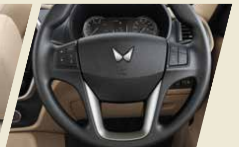
Tilt steering with mounted controls.