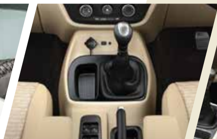
Premium center console