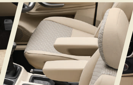
Armrests in the front and middle rows