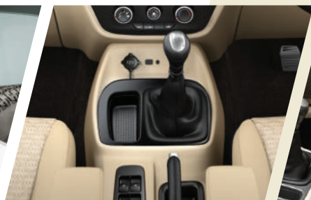
Premium center console