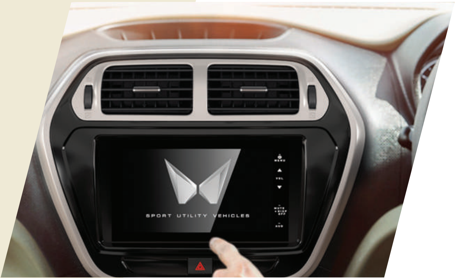
Advanced 17.8 cm touchscreen infotainment system