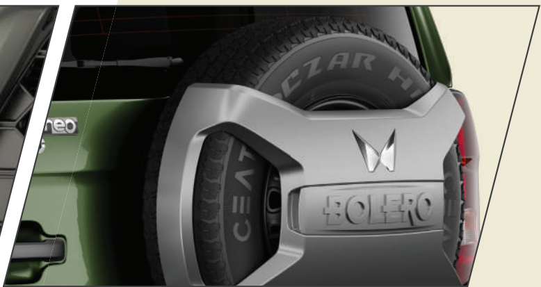
Signature Bolero branding on spare wheel cover