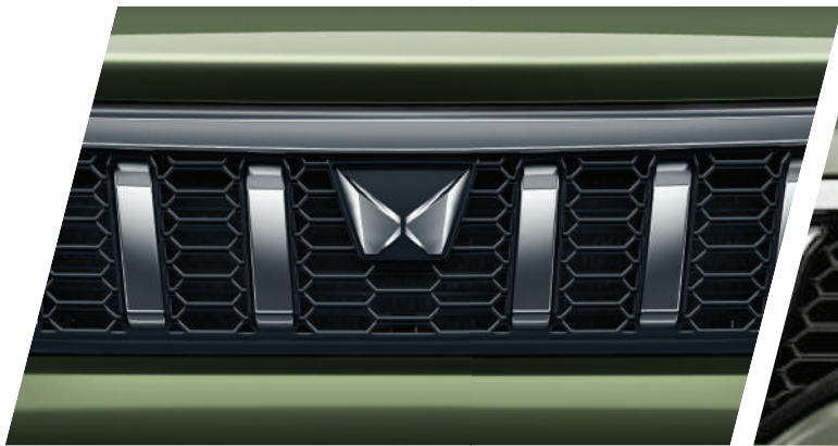
Bolero family grill with chrome inserts