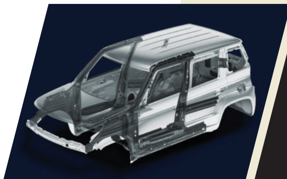
High strength steel body shell