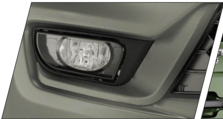
Stylish fog lamp