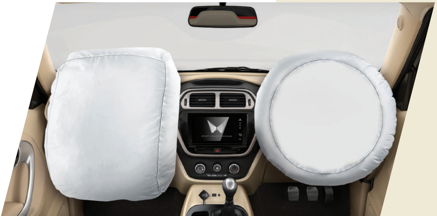
Dual airbags for driver and co-driver