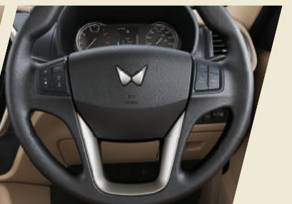
Tilt steering with mounted controls.