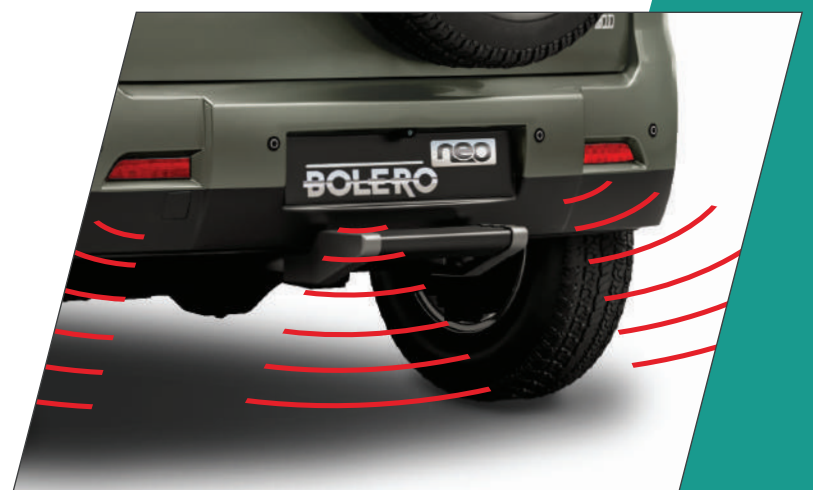
Intellipark reverse assist