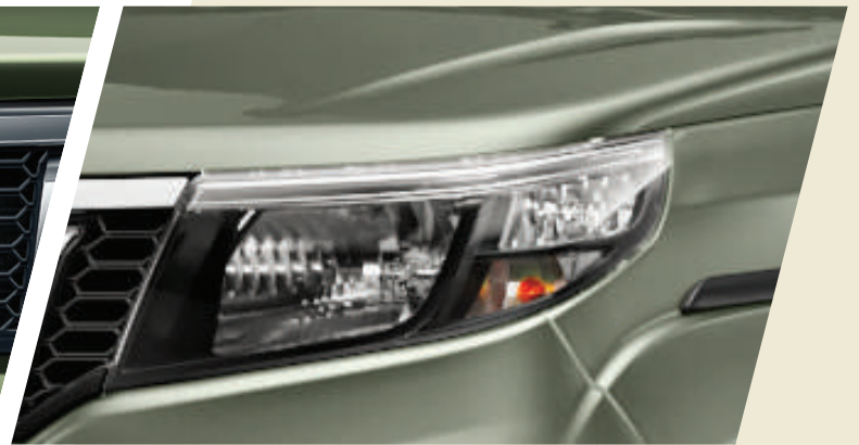
Sporty headlamps with DRLs