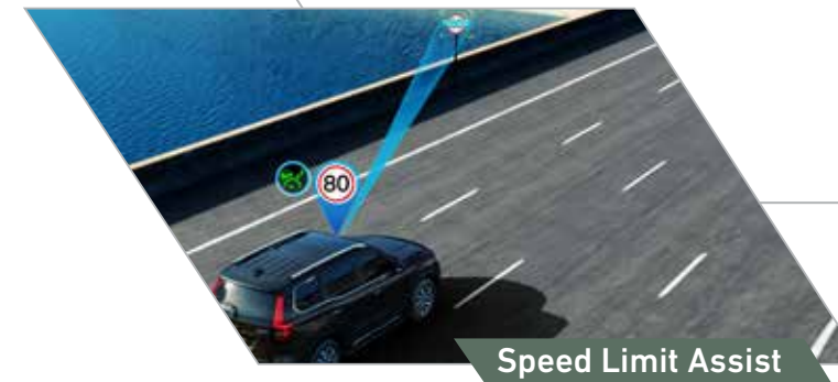
Speed Limit Assist

The Lane Departure Warning (LDW) system offers visual, audio, and haptic alerts to the driver whenever the car is going out of its lane on either side with/without driver input.