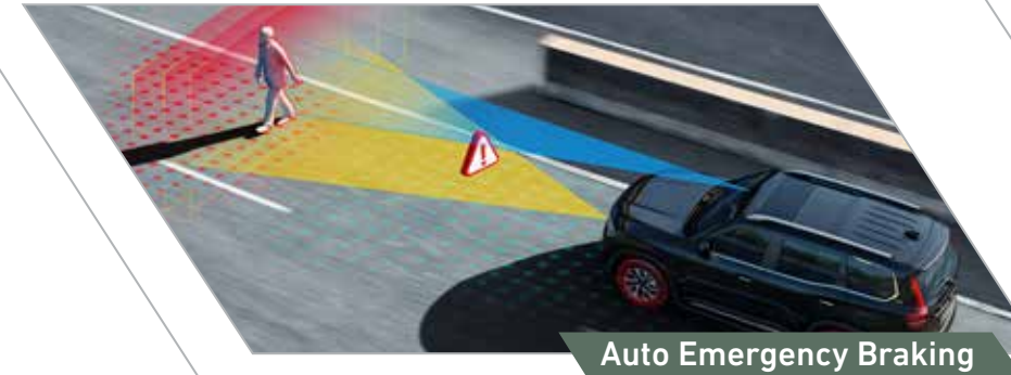
Auto Emergency Braking

Forward Collision Warning (FCW) warns you of imminent collision with vehicles and pedestrians.