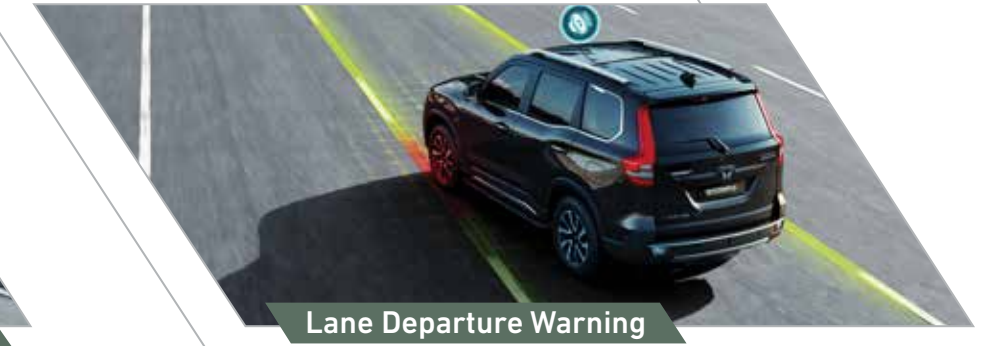
Lane Departure Warning

Automatic Emergency Braking (AEB) constantly scans the surroundings. It detects potential collision situations involving vehicles, cyclists, and pedestrians.