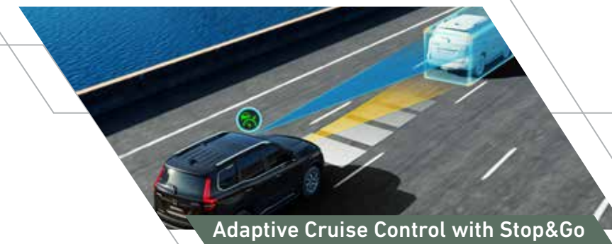
Adaptive Cruise Control with Stop&Go

The Smart Pilot Assist Employs a virtual smart pilot to take charge of steering, acceleration and braking to help the driver maneuver Scorpio-N better.