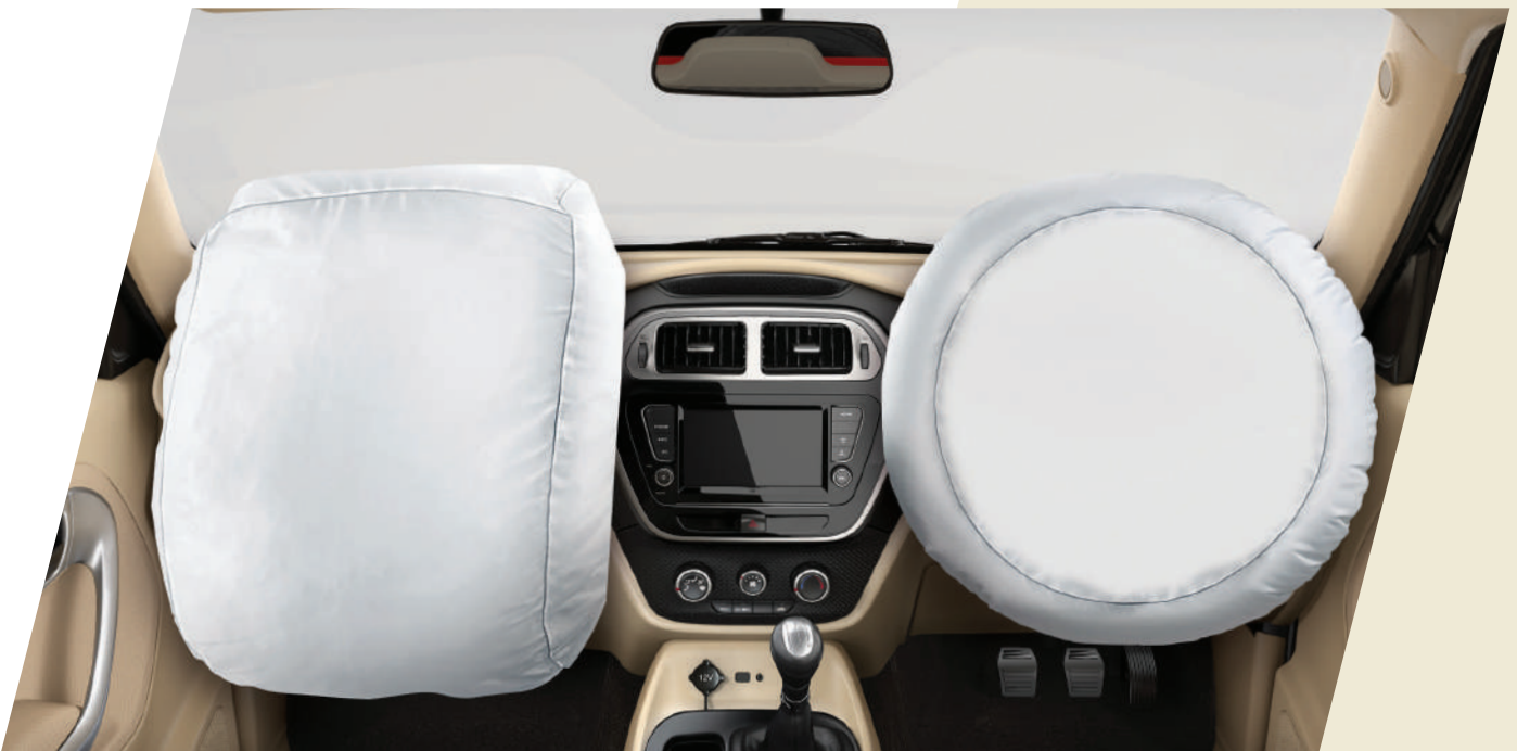
Dual airbags for driver and co-driver