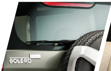
Rear wash and wiper with defogger