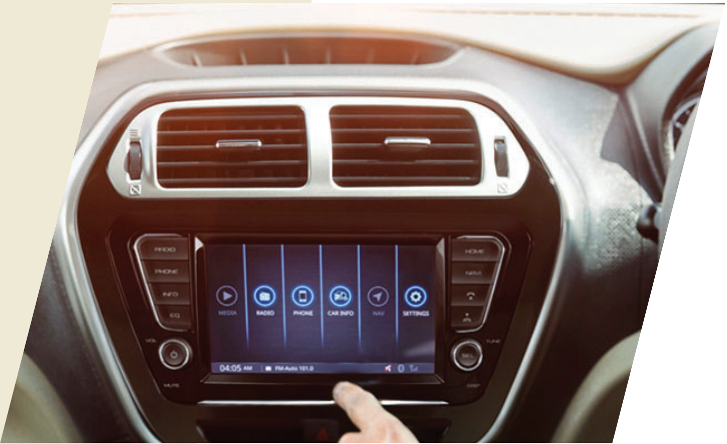
Advanced 17.2 cm touchscreen infotainment system