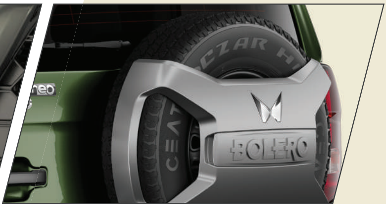
Signature Bolero branding on spare wheel cover