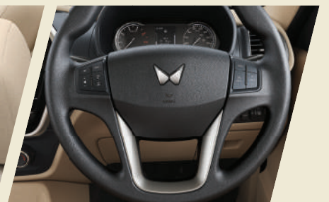
Tilt steering with mounted controls.